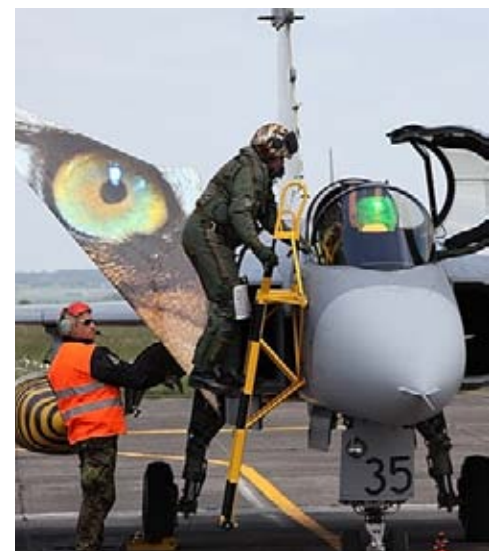
Gripen Pilot of 211 SQN CzAF