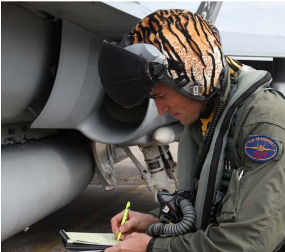
Swiss Hornet Pilot after mission.