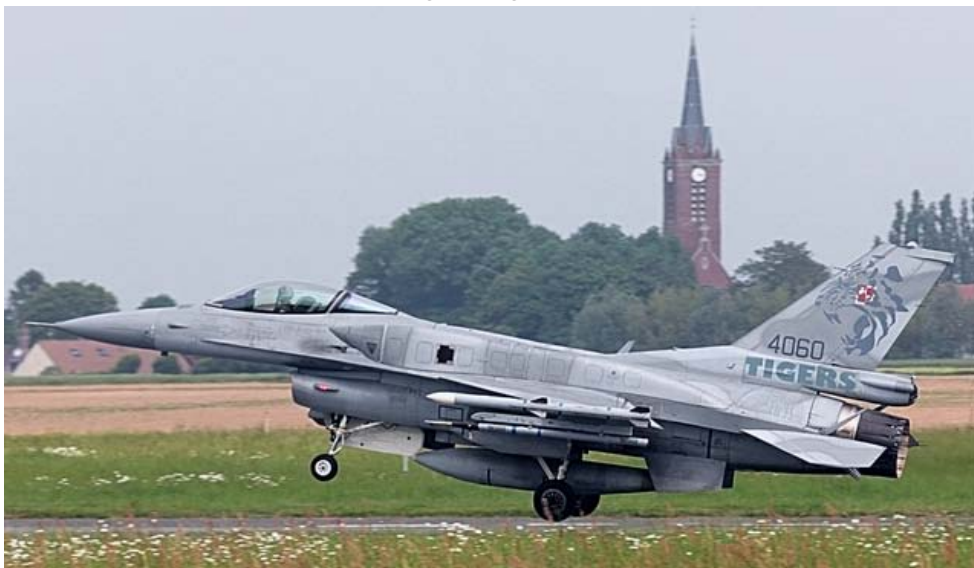
Polish F-16 from Poznań-Kresiny

Cambrai - The majority of NTA member squadrons showed up at the home of Escadron de Chasse 01.12 “Cambresis” despite the ongoing operations over Libya, where quite some Tiger Squadrons are involved. The French authorities had to cancel a series of other exercises, but managed to save the NATO Tiger Meet (NTM). Out of 24 tiger squadrons from 18 nations that had been planned for the exercise, 20 squadrons attended the Meet, some even just for one week or the weekend like the Spanish Tigers. Even so, over 60 aircraft joined the exercise together with more than 900 aircrews and technicians for the conduct of Composite Air Operations (COMAO) over France, Belgium, Netherlands and Germany. It was already the 7th time that EC 01.12 organized the NATO Tiger Meet (NTM) at Cambrai. For the first time a Polish tiger squadron participated on a NATO Tiger Meet with 6 F-16C/D (Block 52+) of the 6th Eskadra Lotnictwa Taktycznego (ELT) from Poznań-Kresiny. The Tiger Assembly voted 6 ELT into the NTA as probationary members. Also, full membership was given to 335 Mira (SQN) Hellenic Air Force from Araxos / Greece after some years as a probationary member. For the first time they brought their new F-16C/Ds after converting from A-7E Corsair II in 2008. Another well received participant was NTA honorary member 1 SQN from Sliac in the Slovak Republic with 2 MiG-29 that flew a few missions at the beginning of the second week.