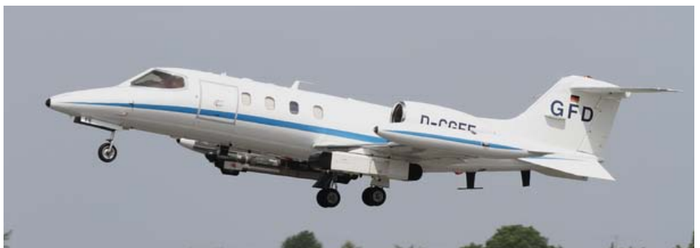
Learjet of GFD company from Hohn / Germany flew electronic jamming missions.