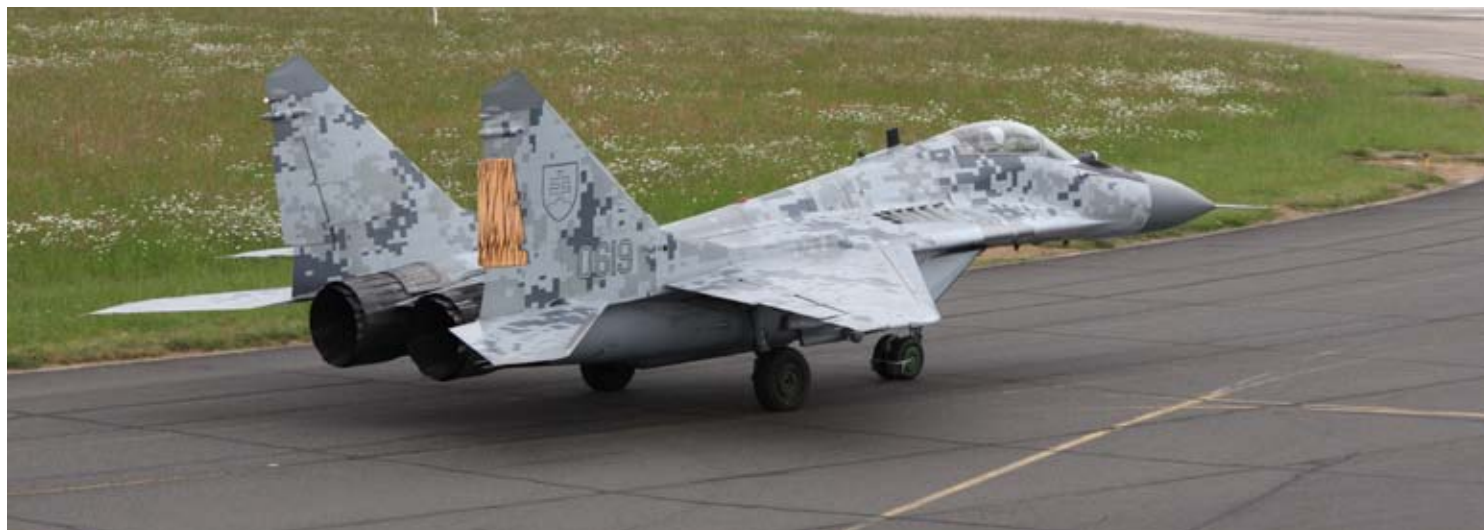
MiG-29's of 1 SQN from Sliac in Slowac Republic flew also a few Missions