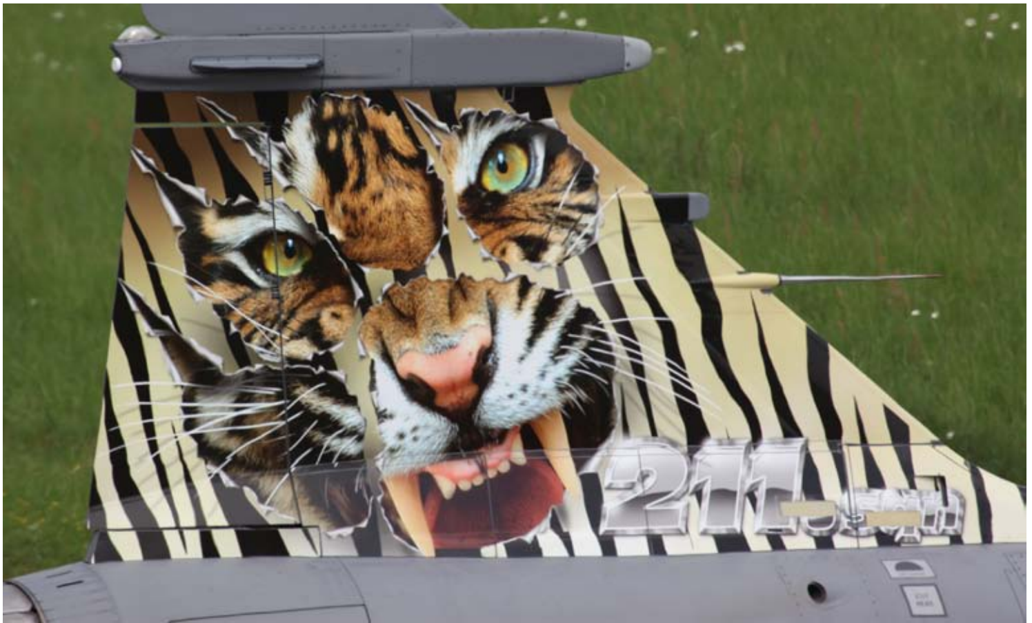
tail of 211 Sqn / CzAF JAS-39 Gripen in special colour.

organises the whole logistic and operational details. This is a particular strength of the exercise, because all participating squadrons can come up directly with their special needs for training during the planning phase without going through the whole chain of command between nations and staffs. On the other side a Fighter squadron also depends on support from external units and cannot always communicate from their level of command directly with other branches in the armed forces. That is when I start to enter the play as an exercise director. My task is to be the direct link between the squadron, the headquarters and the supporting units with respect to operational and logistical matters.”