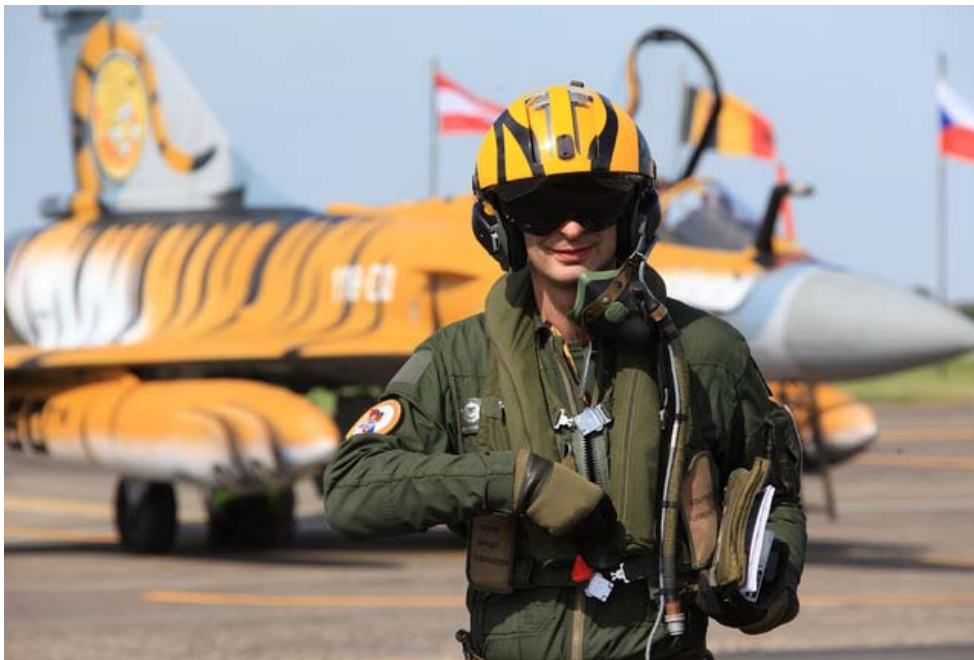
Mirage 2000 Pilot in front of his aircraft.

Cambrai - The majority of NTA member squadrons showed up at the home of Escadron de Chasse 01.12 “Cambresis” despite the ongoing operations over Libya, where quite some Tiger Squadrons are involved. The French authorities had to cancel a series of other exercises, but managed to save the NATO Tiger Meet (NTM). Out of 24 tiger squadrons from 18 nations that had been planned for the exercise, 20 squadrons attended the Meet, some even just for one week or the weekend like the Spanish Tigers. Even so, over 60 aircraft joined the exercise together with more than 900 aircrews and technicians for the conduct of Composite Air Operations (COMAO) over France, Belgium, Netherlands and Germany. It was already the 7th time that EC 01.12 organized the NATO Tiger Meet (NTM) at Cambrai. For the first time a Polish tiger squadron participated on a NATO Tiger Meet with 6 F-16C/D (Block 52+) of the 6th Eskadra Lotnictwa Taktycznego (ELT) from Poznań-Kresiny. The Tiger Assembly voted 6 ELT into the NTA as probationary members. Also, full membership was given to 335 Mira (SQN) Hellenic Air Force from Araxos / Greece after some years as a probationary member. For the first time they brought their new F-16C/Ds after converting from A-7E Corsair II in 2008. Another well received participant was NTA honorary member 1 SQN from Sliac in the Slovak Republic with 2 MiG-29 that flew a few missions at the beginning of the second week.