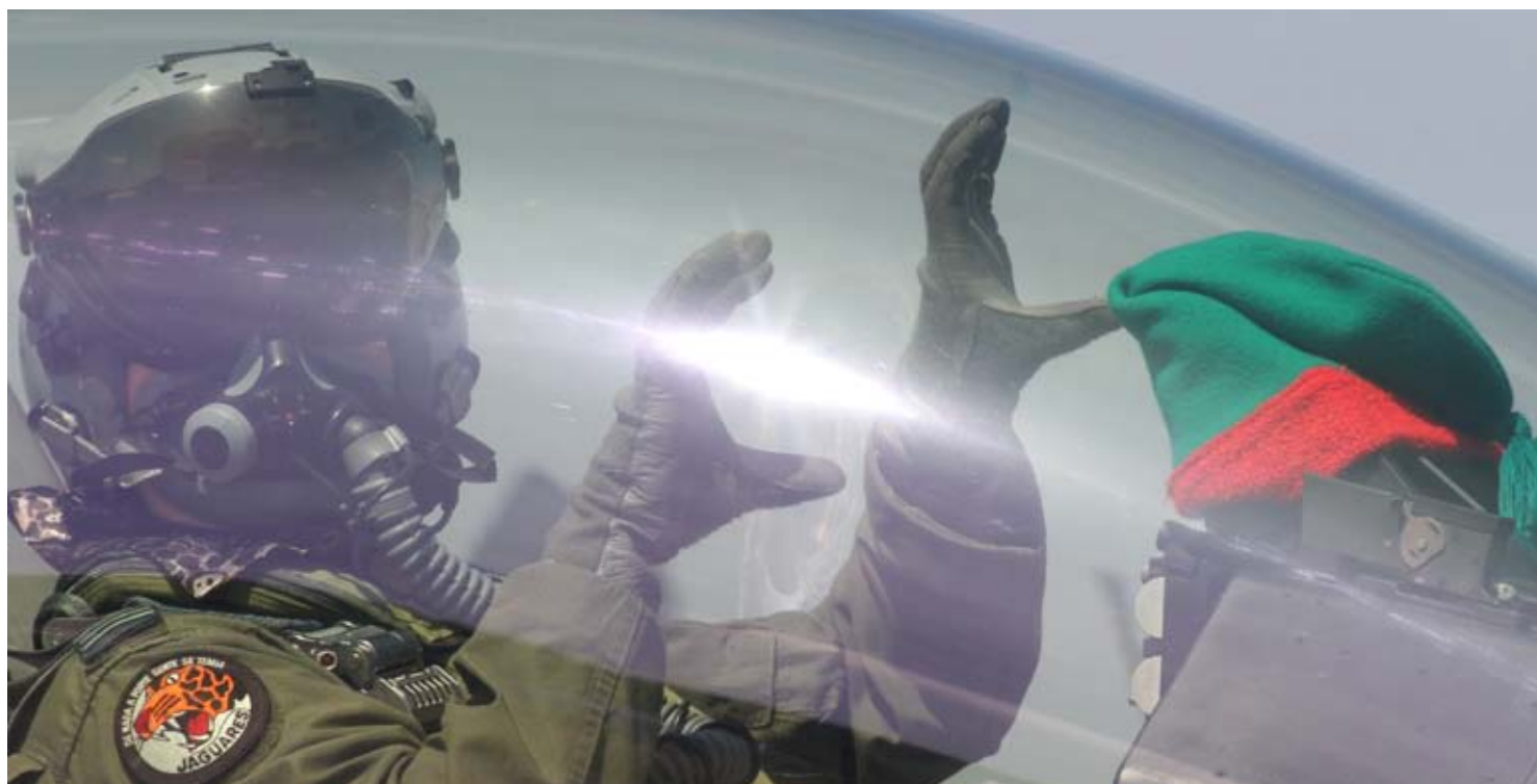
Pilot of 301 SQN from Monte Real shows tiger claws.