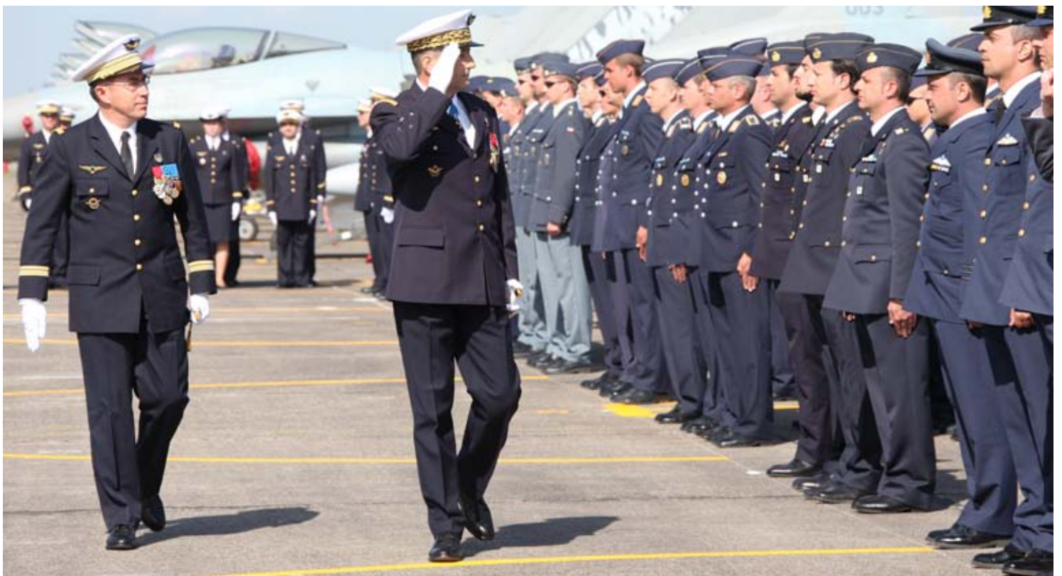
Général de Corps Aérien H. Hendel at anniversary celebrations.

organises the whole logistic and operational details. This is a particular strength of the exercise, because all participating squadrons can come up directly with their special needs for training during the planning phase without going through the whole chain of command between nations and staffs. On the other side a Fighter squadron also depends on support from external units and cannot always communicate from their level of command directly with other branches in the armed forces. That is when I start to enter the play as an exercise director. My task is to be the direct link between the squadron, the headquarters and the supporting units with respect to operational and logistical matters.”