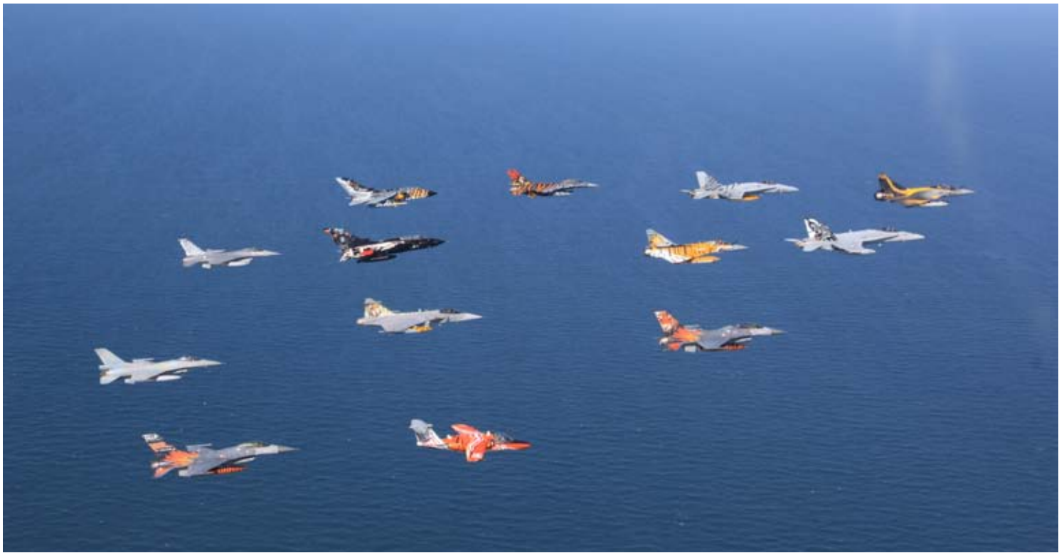
Tiger Tail in mass Formation

slow moving aircraft, various types of scenarios were offered in the exercise play. One major point of focus was the integration of helicopter forces into the fast jet scenario. In the interaction of forces the detailed preparation and coordination has become more and more important, especially with changing situations. After all the missions were flown, thorough debriefings led to “lessons learned”.