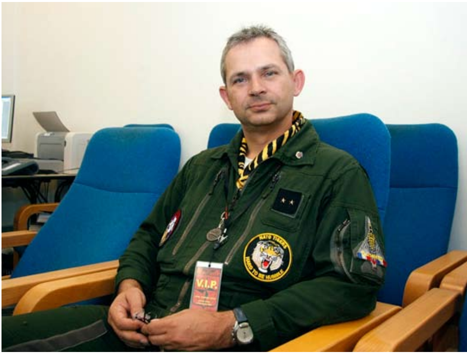
Général de brigade aérienne (Brigadegeneral) Denis Mercier from Armée de l'Air is convinced by the „Tiger Spirit“.

sometimes differs from the point of view of headquarters and is one of the keys to the success and effectiveness of the Tiger Meet. In the future it will be of great importance to continue to optimize operational training for the aircrews” explains General Mercier.