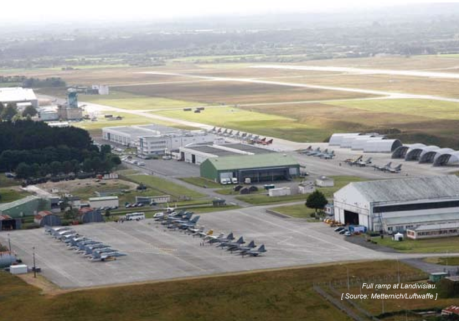
Full ramp at Landvisiau.

Planning – “At the present time specific high value training is more important than ever before. Large exercises are expensive and not easy to organize. Taking into account increasing deployment times of the technicians and aircrews, early planning and coordination is necessary to have a good planning base on the working level” notes General Mercier. “An exercise like the Tiger Meet, based on squadron initiative, can be organized at fairly low costs, but has to rely on the coordination of the headquarters. It is important that they understand the high training value in order to deconflict it with other exercises and incorporate it into their annual schedule.” For 2009 the preparation of the next Tiger Meet at Kleine Brogel Airbase in Belgium is already in full course. A two-week exercise is planned, which will support good COMAO-training. Maybe the Eurofighters from 12 Gruppo (squadron) at Gioia del Colle in southern Italy, and the Fulcrums from the Slovak Republic will participate so as to carry on the old saying: “Once a tiger, always a tiger”.