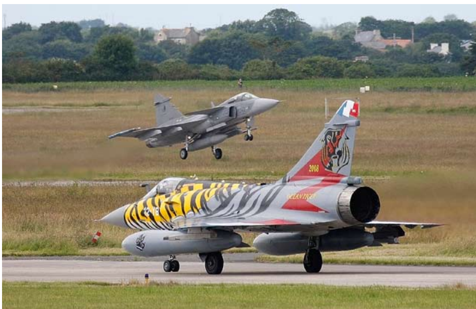
French Mirage 2000 on taxiway in front of Czech JAS-39C Gripen taking off.

On the island, just off the south-western coast of the Bretagne, personnel of the United Nations were captured by hostile troops. The Special Forces are tasked to free the hostages and evacuate them. In NATO phraseology