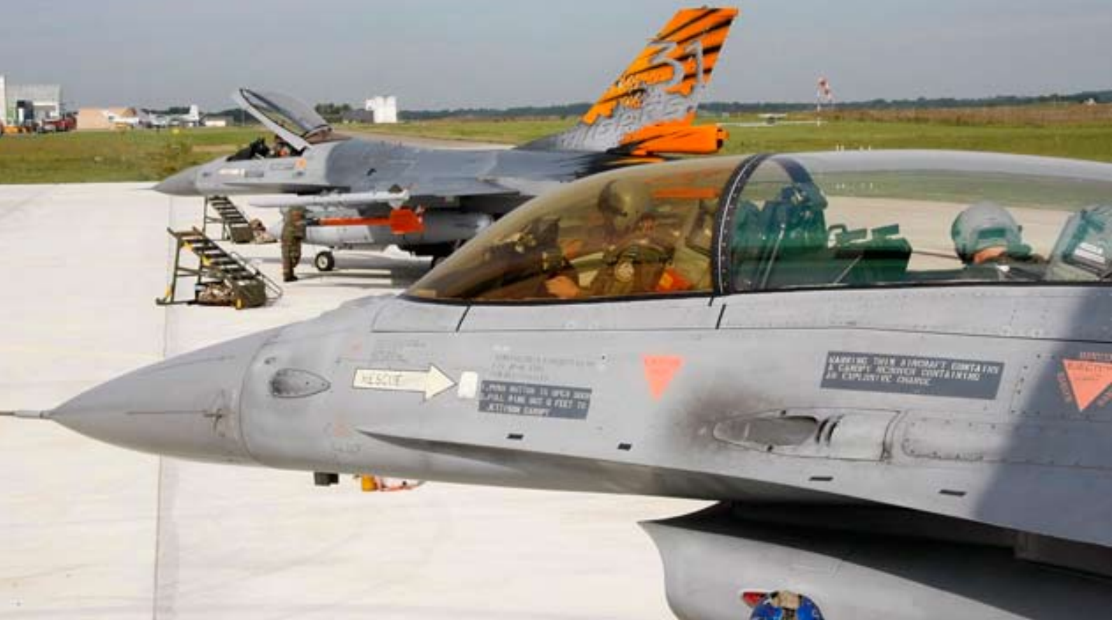
Belgian F-16 preparing for takeoff

corporate identity, what civilian companies use to optimize their productivity. It shows the strong bonds between the Tiger-squadrons and the different nations. The old stupid cliché (from perhaps the 70's) that the Tiger Meet is only Partytime should be refuted in the strongest possible way. Facing smaller budgets and more operational tasking the Tiger Meet could not exist any longer, if it had not constantly shown its operational training value.