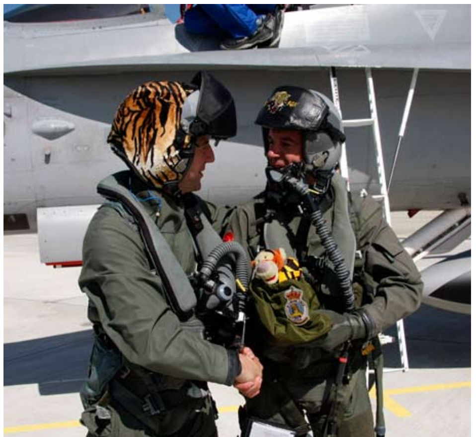
Pilot of 31 Squadron thanks the Swiss Detachment Commander for taking the Mascot „Tijgetje“ with an F/A-18 Hornet up into the French skies.

„I fly for Charity“ – With this slogan a small tiger puppet named “Tijgetje” flies around the world for children that are ill from cancer. Aim of the project is to collect as much money as possible for the “Belgian Children’s Can-