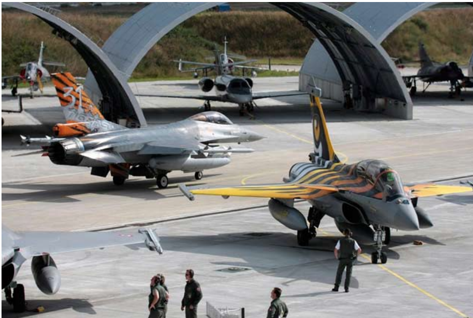
Belgian F-16 and French Rafale on the apron.

Landivisiau – 14 flying squadrons from 8 nations met at the end of June on the French Navy Base 30 kilometers northeast of Brest. Almost 500 pilots and technicians with 36 aircraft and 8 helicopters visited the French Navy. In addition observers from Italy, Norway and Greece were present, but did not play a part in flying operations. During 5 exercise-days Composite Air Operations (COMAO) were flown on a daily basis with sometimes more than 40 aircraft airborne. Different forces had to work together. Fighter and recce aircraft, bombers, CSAR-helicopters (Combat Search and Rescue) and one E-3A NATO Early Warning Aircraft from 1 Squadron Geilenkirchen / Germany flew complex mis-