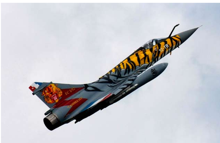
Mirage 2000 from Escadron de Chasse (EC) 01/12 at Cambrai.