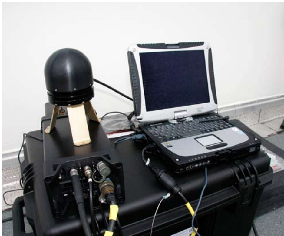
ROVER 4 (Remotely Operated Video Enhanced Receiver) Receiver Antenna and Laptop.

was really impressive to see how the squadron managed to organize the Meet in such a short timeframe. Never before have we had 80 missions flying on a single day at Landivisiau. It was a brand new experience on the flying as well as the logistics part. Of course we had excellent planning support from Kleine Brogel and Cambrai, but at the end we had to cover it all on our own. Nobody in the squadron complained about the long working days during the preparation of NTM 08. Everybody in the squadron had the same goal, to make "NATO Tiger Meet 2008" a success.