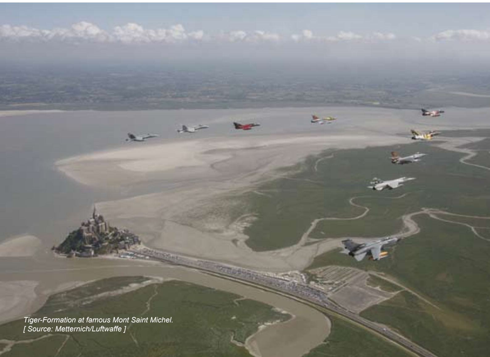
Tiger-Formation at famous Mont Saint Michel.

sions together. Under surprisingly stable weather conditions and with few technical cancellations a total of 335 missions were flown. Besides the Austrian Saab 105OE from Düsen-trainerstaffel (Jet Trainer Squadron) at Linz / Hörsching, Czech JAS 39C/D Gripen from 211 Squadron at Caslav participated for the first time in flying