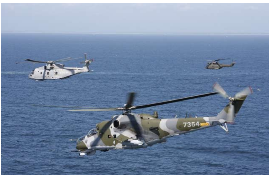
Target-Approach over water - Czech Mi-24 Hind in front of Merlin (left) und Puma Helicopters.