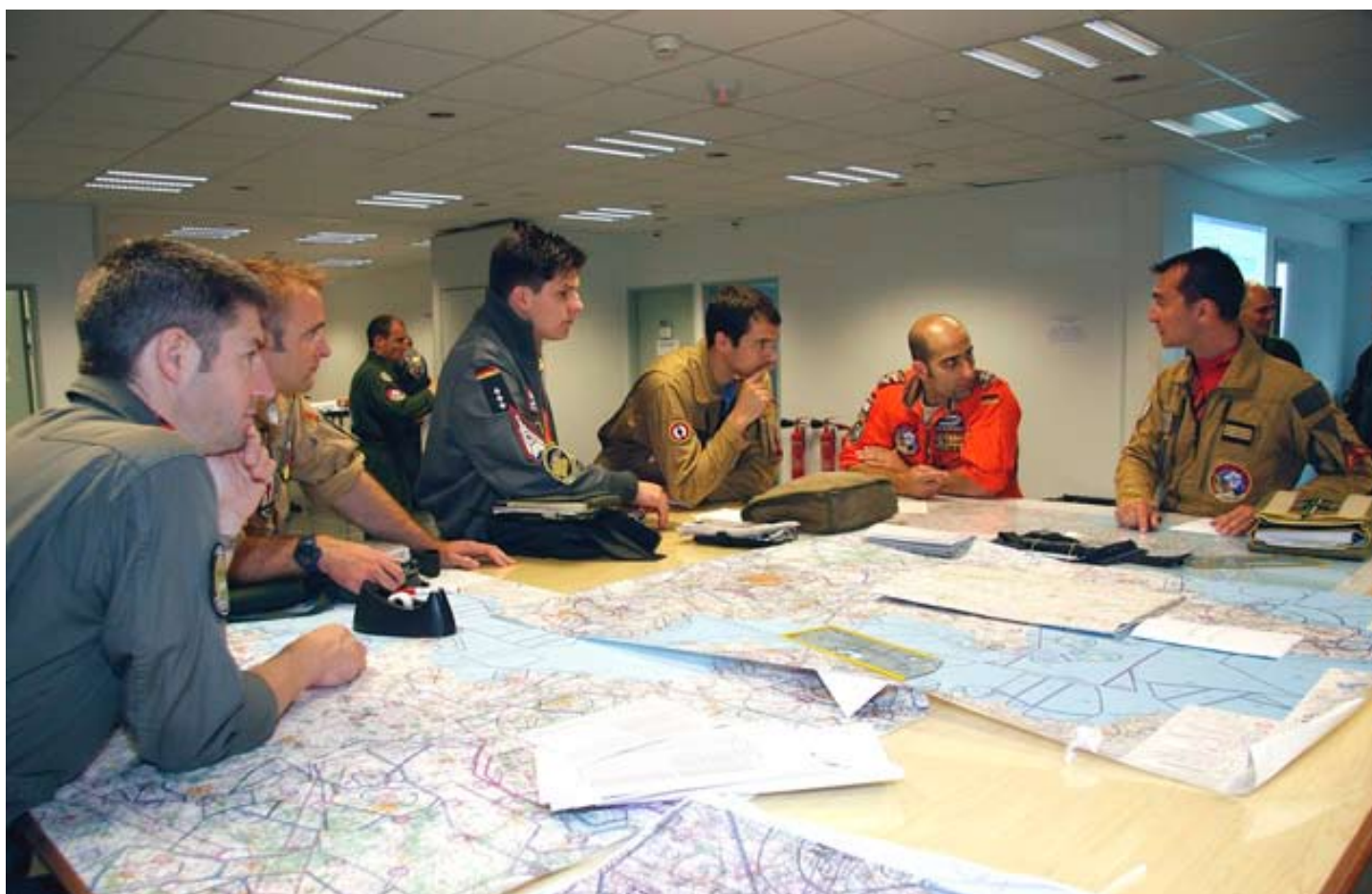
Aircrews from various nations are planning a COMAO.

High value training – For young aircrews the Tiger Meet is something special and new. Besides tigered flight scarves, colourful aircraft, and the famous tiger-traditions (which they already know about within their own sqdns), it is for many their first time to attend a multinational exercise. That was the case also for Cap-